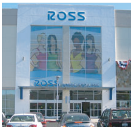
Ross' exciting new location in Westlake shopping center, Daly City, CA